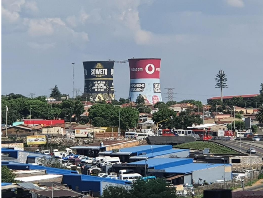
The Famous Soweto Towers