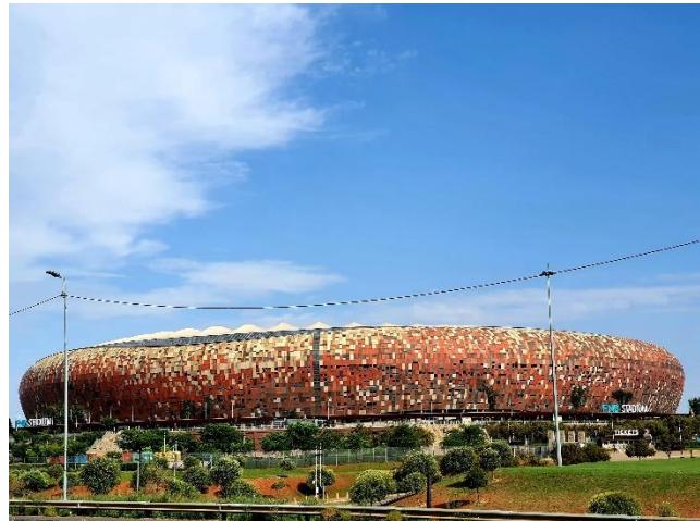
FNB Stadium, World Cup Stadium 2010

We can't wait to overcome this Pandemic. The new NORMAL LIFE has begun and we have to get used to a different life, a different world. The biggest problem for us is the restriction of the traveling. We can only hope that the world wide vaccinations will be done and finalized this year so we all can travel again, for the benefit of many more people with disabilities in Southern Africa. We are planning our Fundraising Tour to Germany for August 2021, sadly we had to cancel this important Fundraising Tour in 2020.